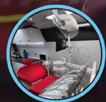
MOBILE DENTAL CLINIC