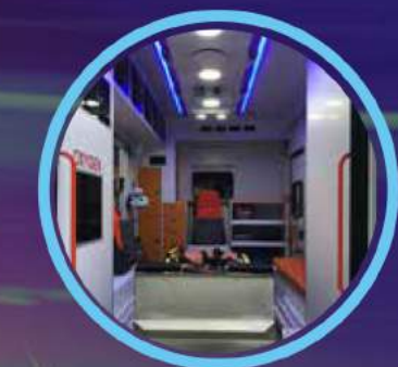
BOX TYPE AMBULANCES