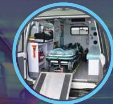
LAND CRUISER AMBULANCES