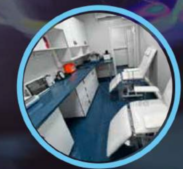
BLOOD DONOR VEHICLE