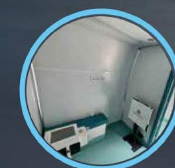
MOBILE X-RAY VEHICLE